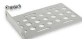
ADJUSTABLE MOUNTING KIT